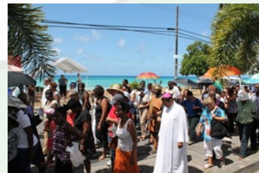
Good Friday Re-enactment 2014