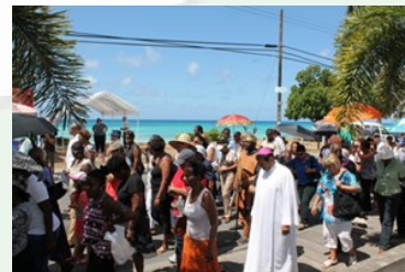
Good Friday Re-enactment 2014